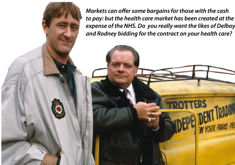
Markets can offer some bargains for those with the cash to pay: but the health care market has been created at the expense of the NHS. Do you really want the likes of Delboy and Rodney bidding for the contract on your health care?